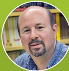
Michael E. Mann

Multi award-winning international Journalist and author, most recently of The Carbon Club .