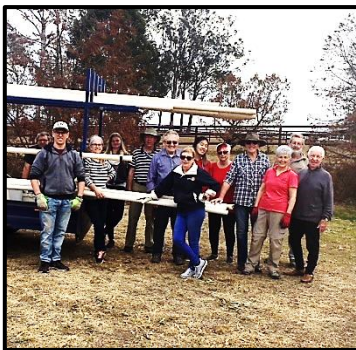
The Sugarloaf Crew

Its national Op Shop Week they are a great place to shop for treasures. They are run by thousands of volunteers across Australia and proceeds go back into community projects, so pop into to one and see what you can find! Let's keep this week galloping along with a smile:)