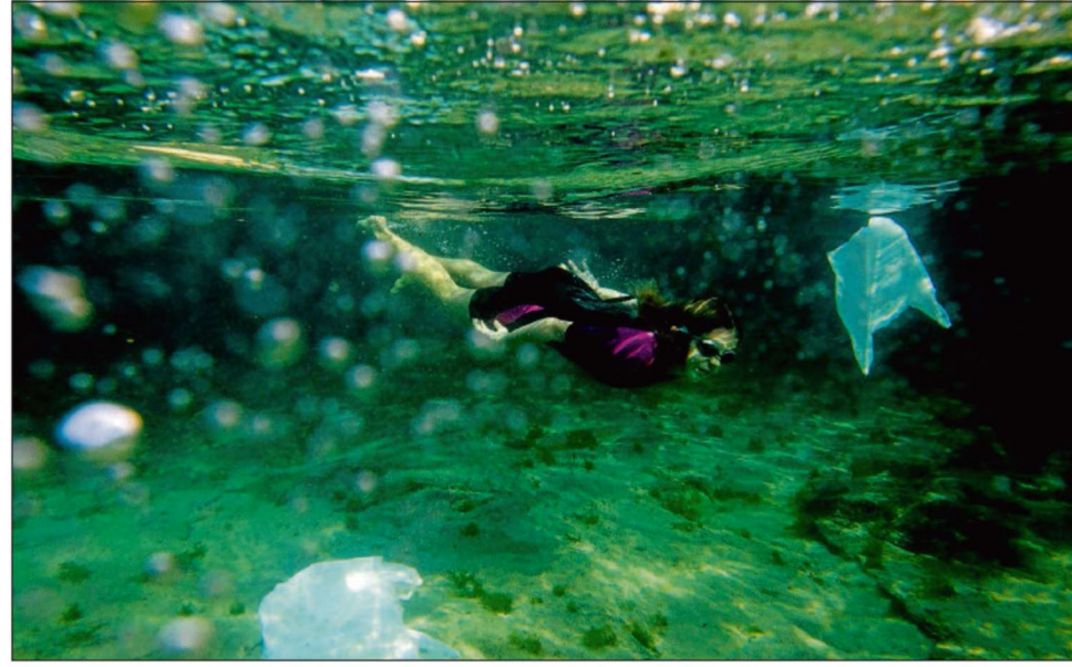
ROTARY CHALLENGE: More than 12 million tonnes of plastic, everything from plastic bottles and bags to microbeads, end up in the world's oceans each year, according to Greenpeace.

Then when planning club activities, for example a barbecue or changeover dinner, they do the simple checklist to identify practical ways to