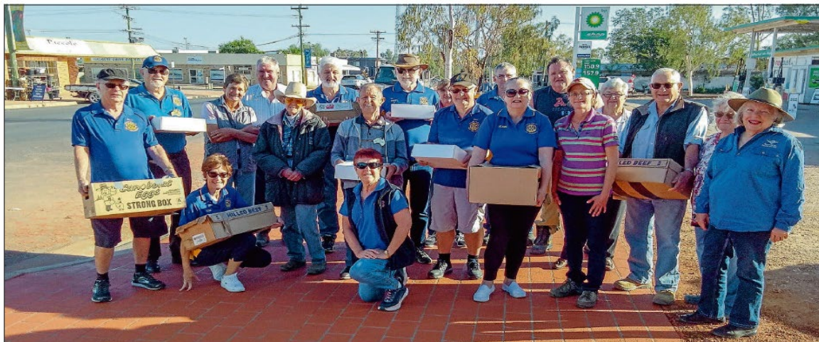
HELPING HAND: Rotary members helping farmers and their families as they fight the impacts of drought.

Most have de-stocked and one family said they could not have provided a meal for an Easter family gathering if